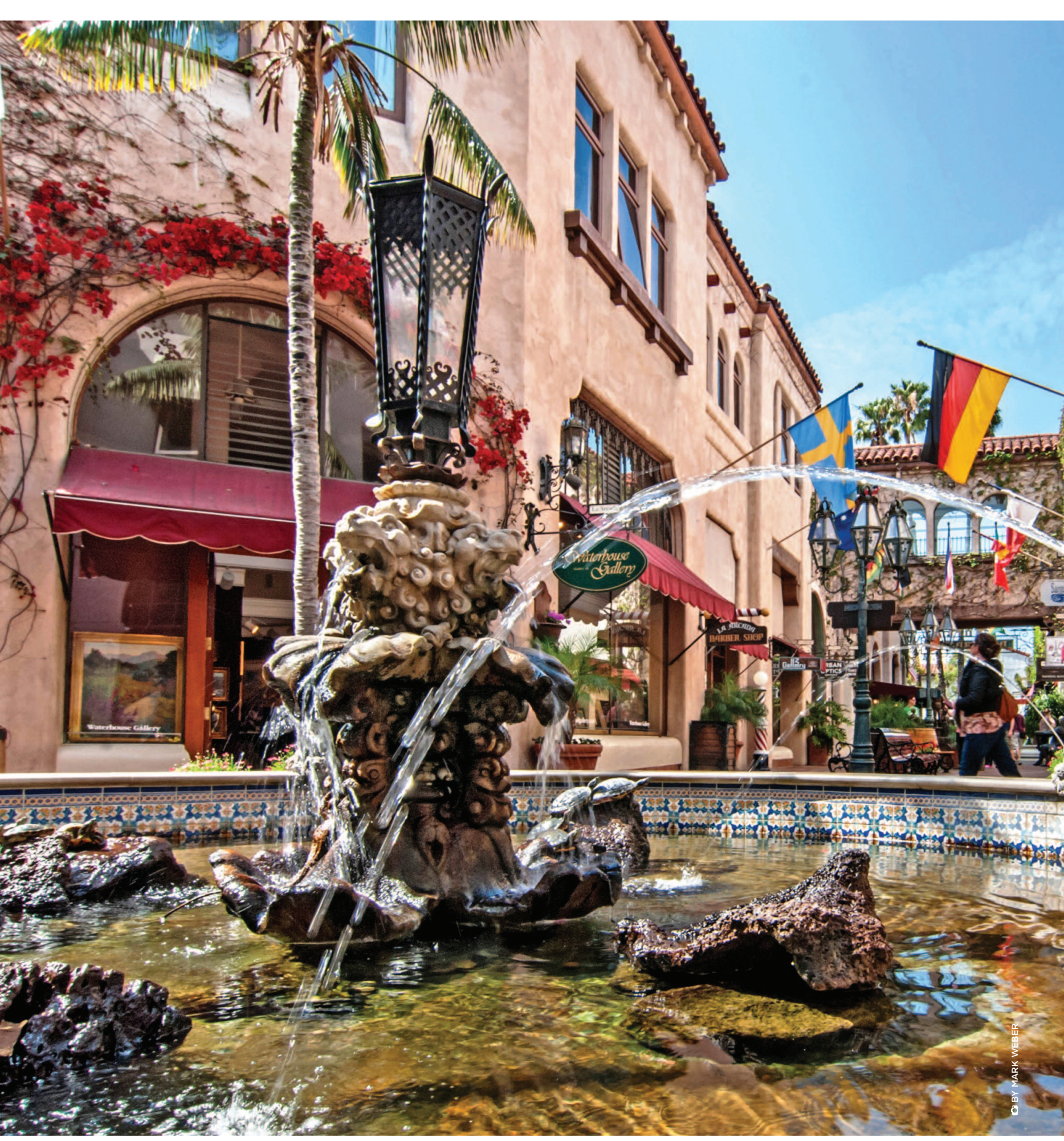
Explore Santa Barbara's La Arcada Court's trendy shops, restaurants and galleries.